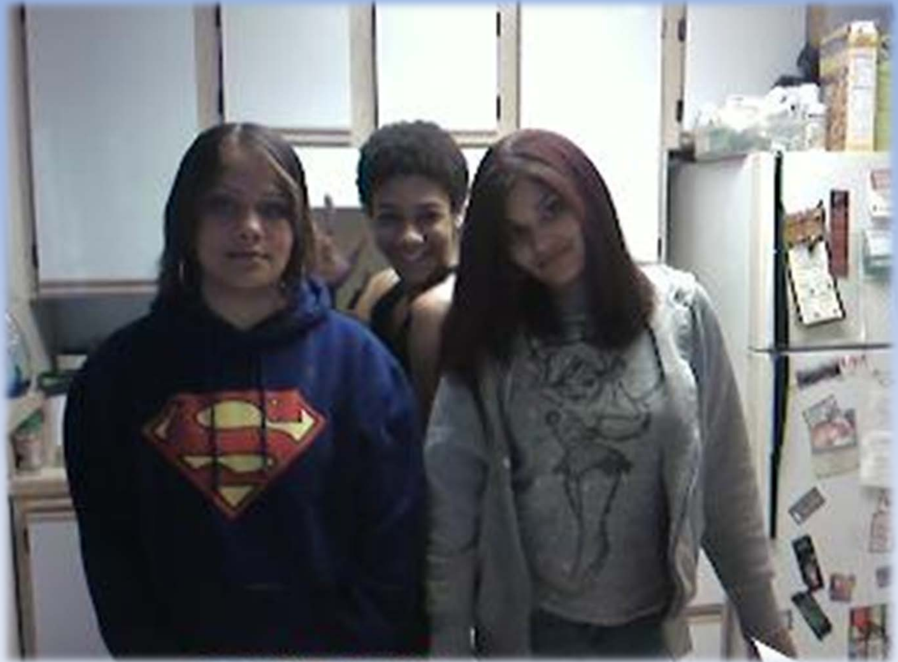
18 th Birthday