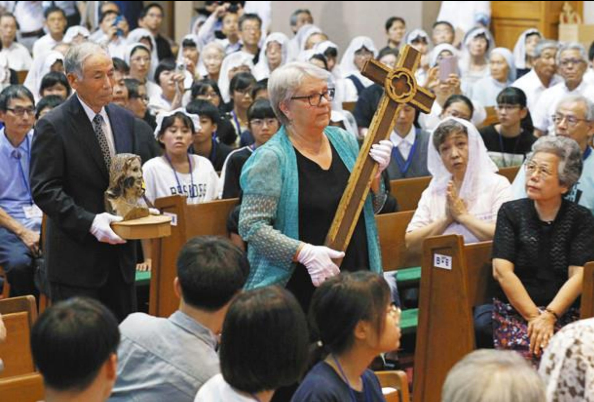
Commemoration Mass at the Urakami Cathedral